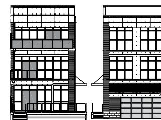
FRONT ELEV. REAR ELEV.