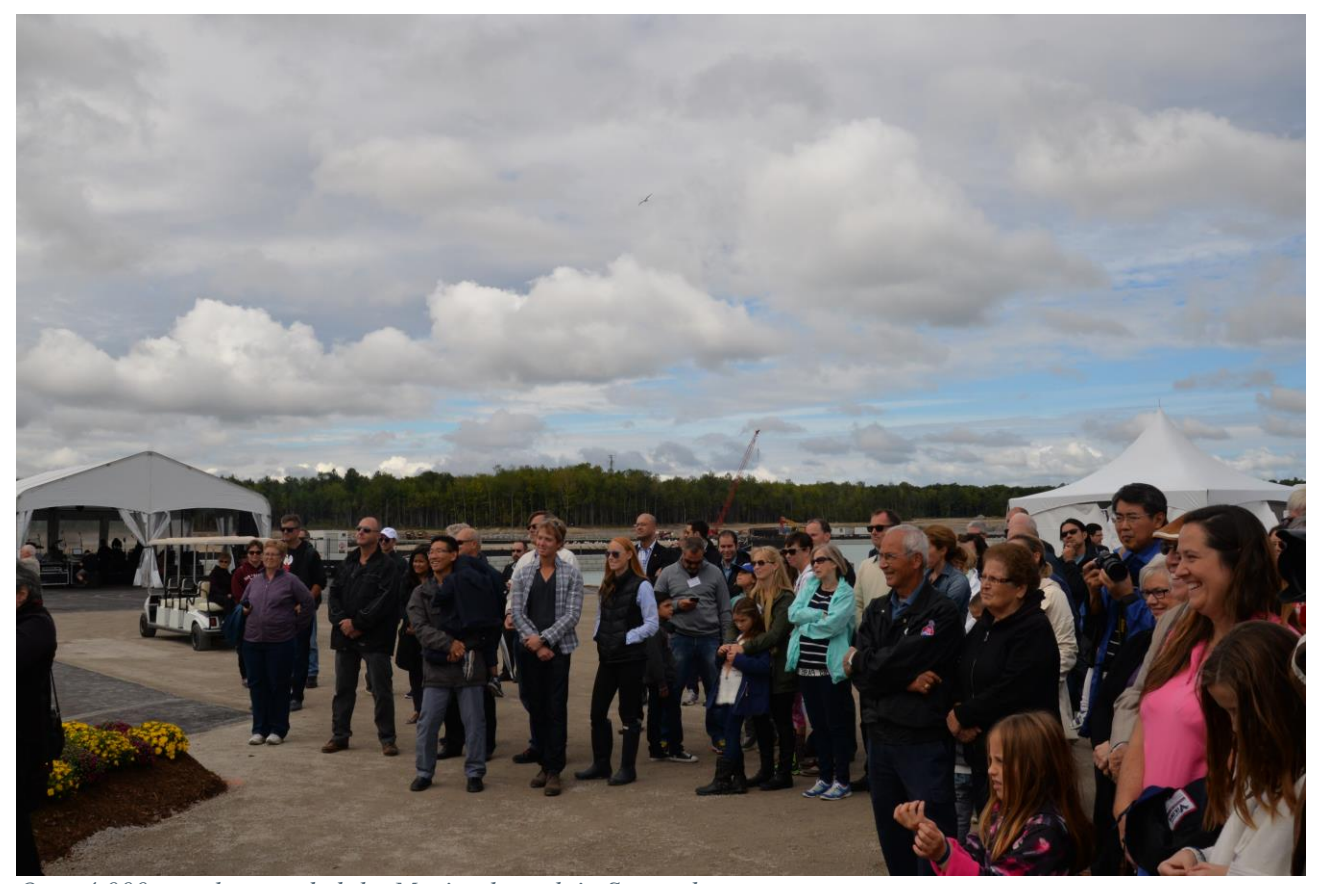
Over 4,000 people attended the Marina launch in September

The site is 10 minutes from Barrie and about an hour's drive from Toronto. Condo owners can also hop on the GO train from Toronto to the Barrie station and be picked up by the resort shuttle. Construction has started on the initial buildings, with first occupancy expected in 2016.