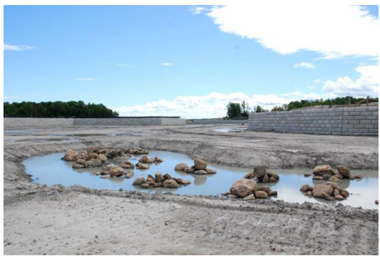
Approximately 30 fish habitats have been created in the Marina.

"We built a new amphibian habitat before we decommissioned the old one and it's been so unbelievably successful," Dudding says. "The water in the old habitat came from surface water (such as rain) and would dry up, so there wasn't enough water for tadpoles to turn into frogs. Now, we've seen an increase of the species of frogs."