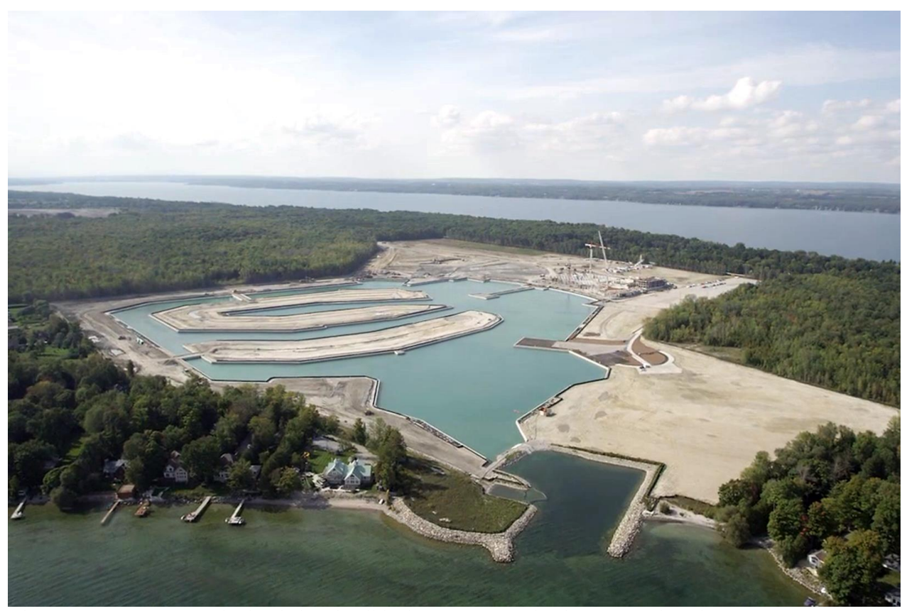
The new Marina is entirely flooded and will be home to several fish, frogs and turtles.

Many of the development's green initiatives are unprecedented in Ontario. Friday Harbour completed the first phosphorous budget in the province and demonstrated that the amount of phosphorous coming off the site into the lake will be less after it's built than before. Phosphorous is a nutrient contained in common items such as detergents, fertilizer, manure and decaying plants.