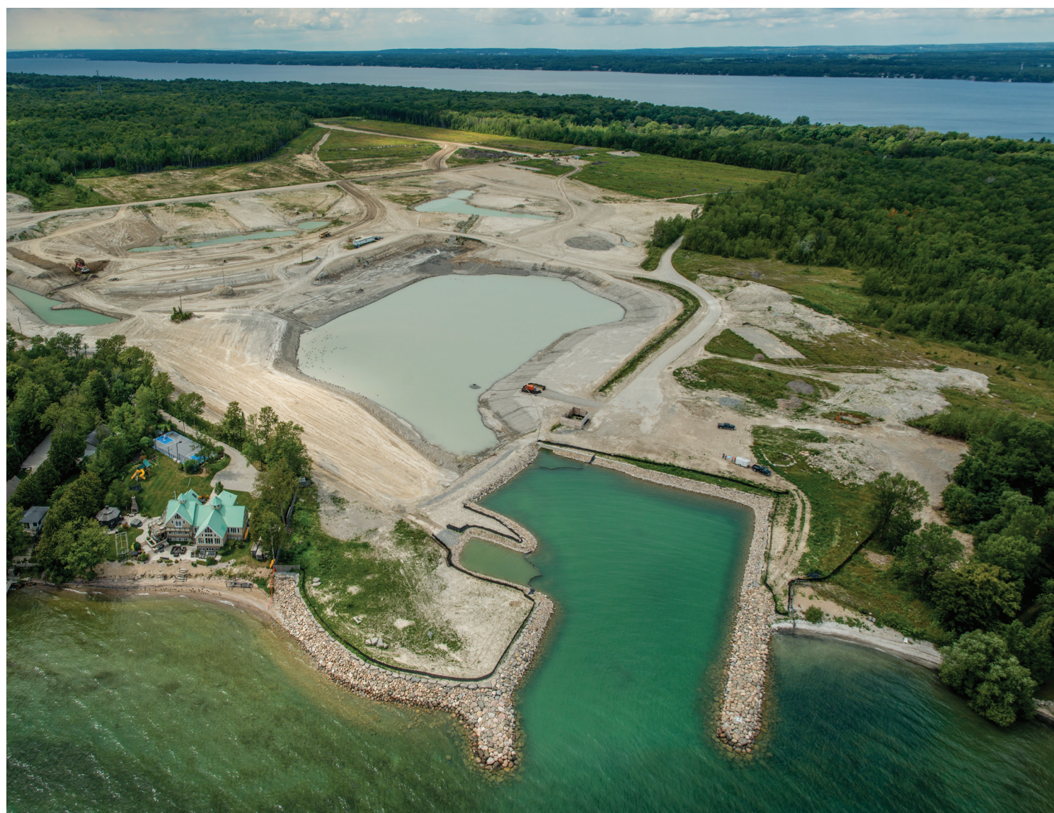
The marina basin will enlarge from 4 hectares to almost 14 hectares on completion. Actual photo, taken August 2013.

The resort's focal point will be Marina Village, which Geranium anticipates will become Simcoe County's ultimate all-season destina-