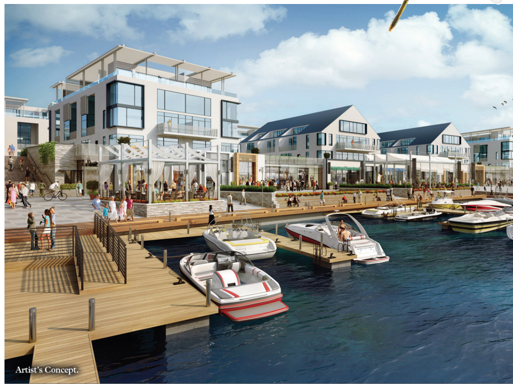
Marina Village (artist's rendering above) will be the resort's focal point, along with a nature preserve.

ers alike can take advantage of, as well as local community and school groups."